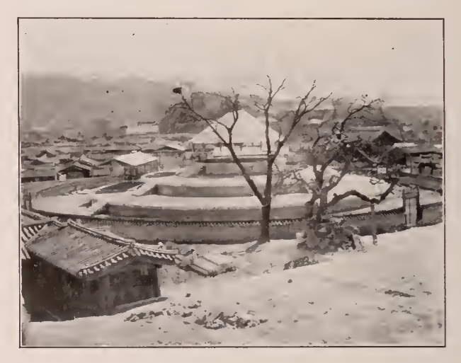
ALTAR USED AT THE CORONATION SERVICE.

never an unkind word or even an implied censure of the conduct or rule of their sovereign. "The King can never do wrong, and he who says the King has not done well is to be treated as an enemy." This tenet is believed by patrician and plebian alike and governs political utterance and action in the empire to-day. The family, not the individual, is the unit in Korea. The father is responsible for the conduct of his family. A prodigal son, an over-